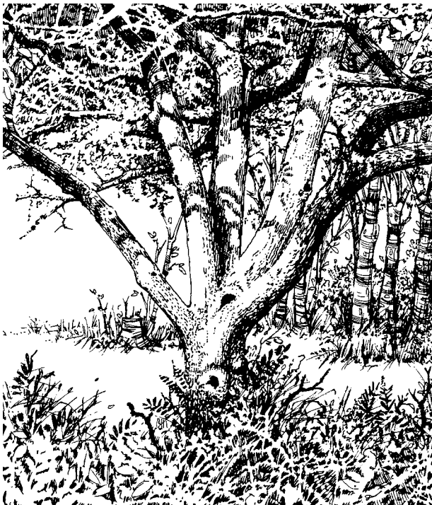
Figure 3. Wolf tree

It is equally important to preserve large quantities of woody ground debris such as fallen trees and de-