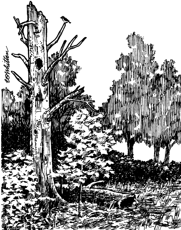
Figure 2. A snag

and they normally produce a bumper crop of mast (nuts), in addition to providing many cavities. Beech and sycamore make ideal wolf trees and should be protected and encouraged within a woodland area or in connecting fencerows.